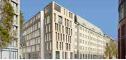
Head office: Stresemannstrasse